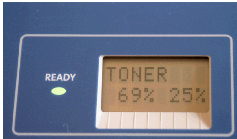
Fig.1-3: Toner cartridge 6000 & 2500 page capacity

The remaining capacity of the toner cartridge and the drum kit can be checked at any time in the "Usage menu". The left percentage of the toner cartridge capacity gives the remaining capacity for a 6000 pages toner cartridge.