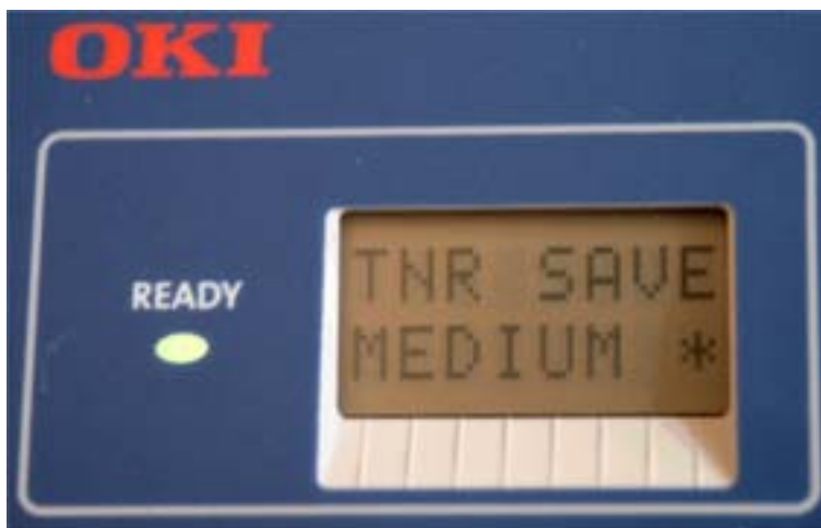
Fig.1-2: Toner save menu