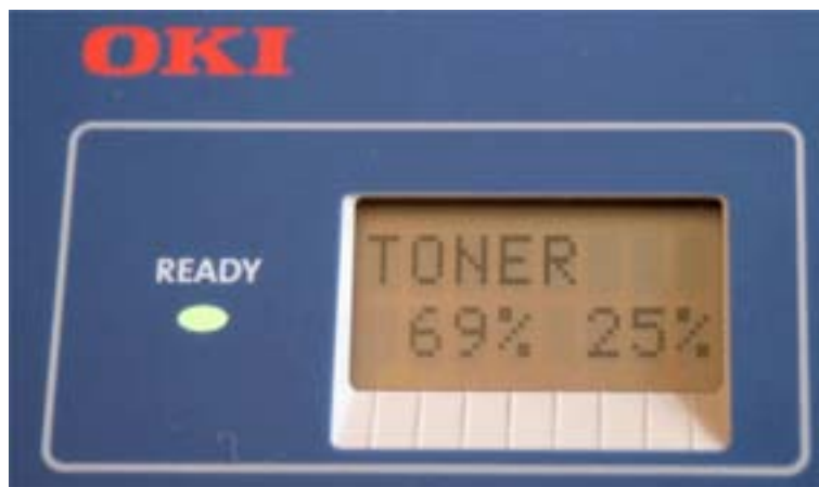
Fig.1-3: Toner cartridge 6000 & 2500 page capacity

The left percentage of the toner cartridge capacity gives the remaining capacity for a 6000 pages toner cartridge.