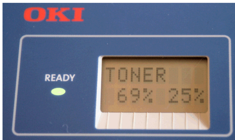
Fig.1-3: Toner cartridge 6000 & 2500 page capacity

The left percentage of the toner cartridge capacity gives the remaining capacity for a 6000 pages toner cartridge.